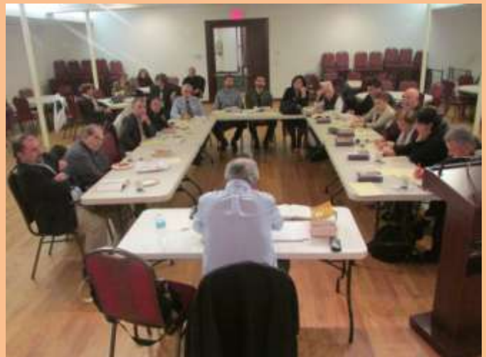
Participants of the Bible Study program