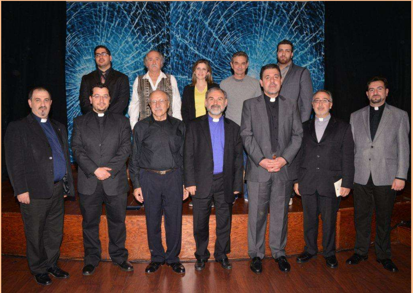
The director with clergy guests and cast members after the performance

The event was sponsored by the New York Hamazkayin Cultural Association.